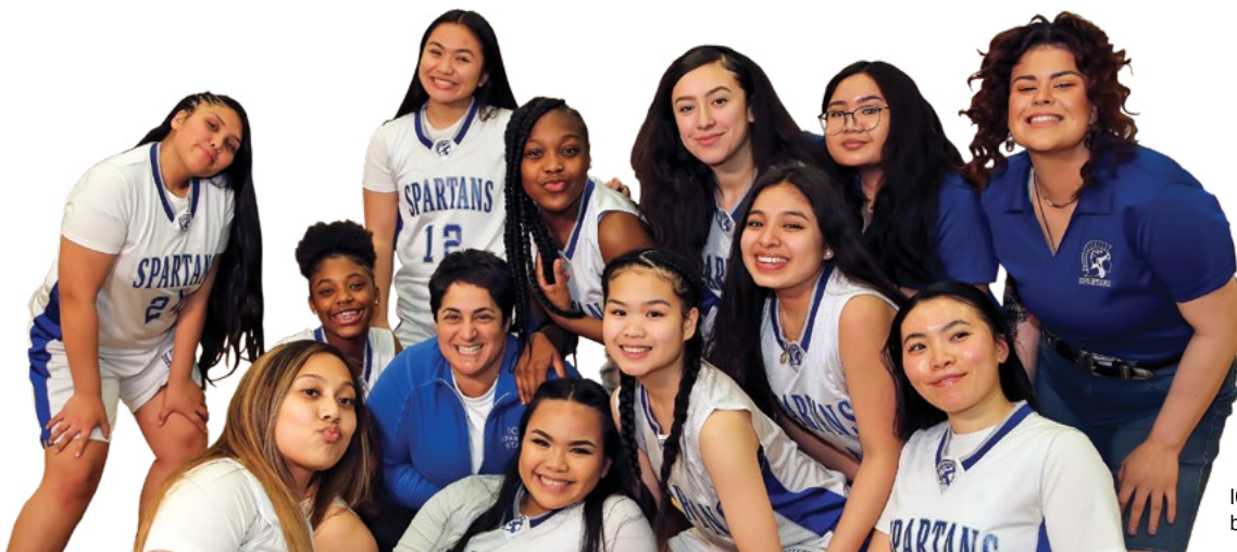
ICA Cristo Rey basketball team

...yet 20% of Bay Area children live below the poverty line.