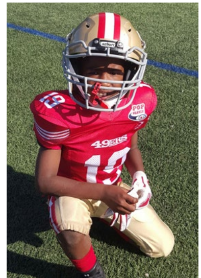
Young player from SFPAL

yet only 37% of U.S. kids play team sports on a regular basis.