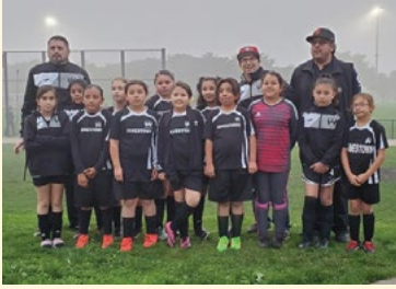
Jamestown Royals Recreational Team, 4 th Grade

Going on 3 years together, the team has grown in their unity and support of one another. As a result of their new uniform sets and equipment, the youth felt extremely motivated and eager to continue building their sense of pride and team chemistry