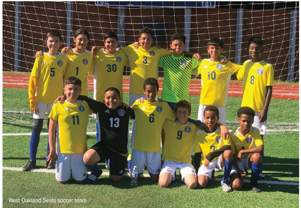
West Oakland Seals soccer team