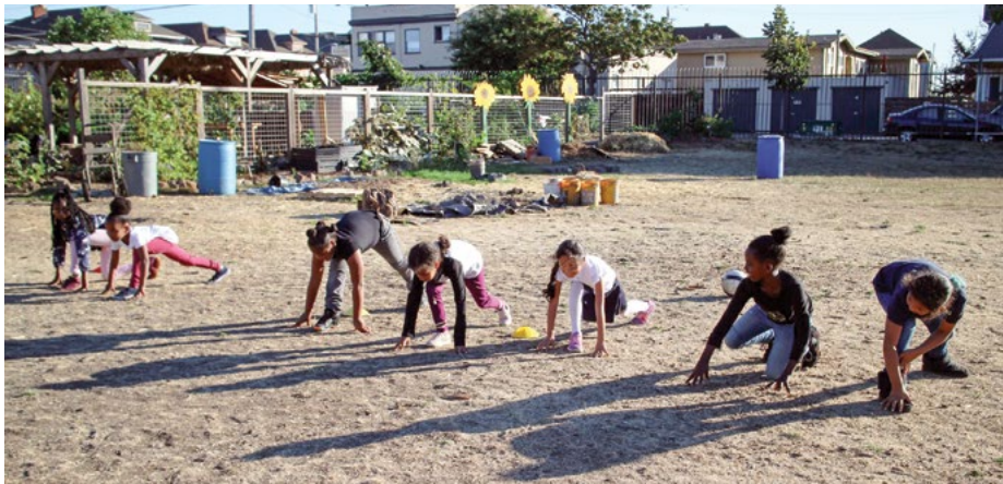
Young athletes from Girls Leading Girls