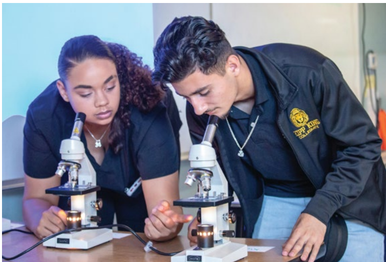
Students from KIPP Bay Area Schools