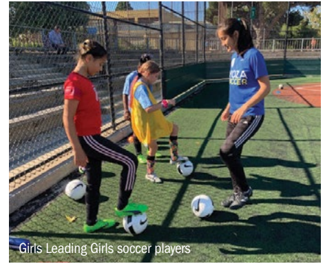
Girls Leading Girls soccer players