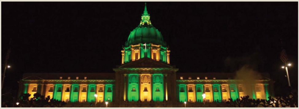
The Mayor's Office lit up City Hall in green and gold in honor of Salesian's 100th Anniversary.