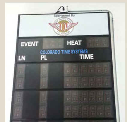
Don Fisher Clubhouse Pool

THE OLYMPIC CLUB FOUNDATION'S SUPPORT IS MORE EVIDENT THAN EVER ON SIGNS AND SCOREBOARDS THROUGHOUT THE BAY AREA