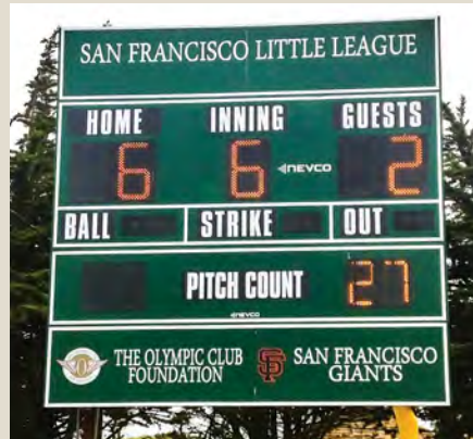
SF Little League Scoreboard