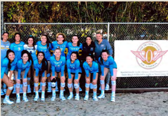
Notre Dame Belmont Volleyball Courts