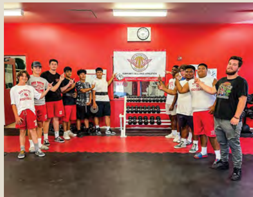
San Rafael High Weight Room