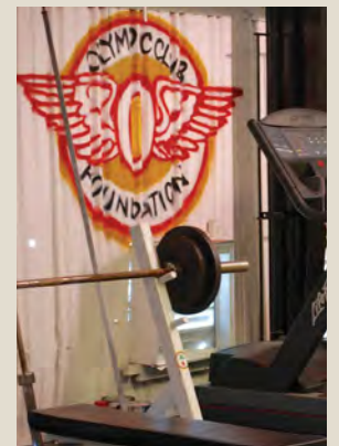
Fire in the Ring