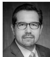
Jeff Hamlin Insurance