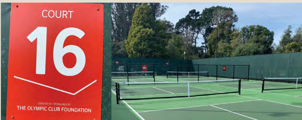
Golden Gate Park Tennis Courts