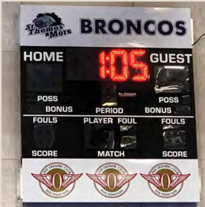
St. Thomas More Grammar School