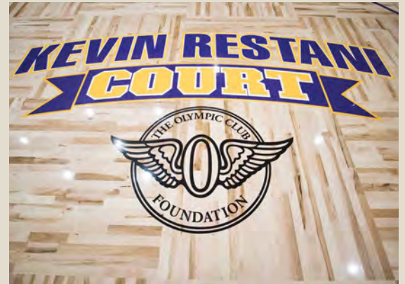
Restani Court at Riordan